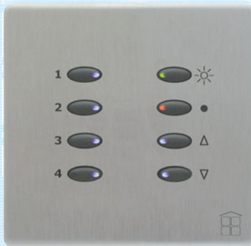
SCE-02-BSS-44 with SCE-02-02-BLK