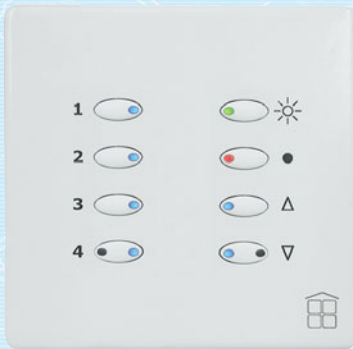
SCE-02-WHI-44 with SCE-02-02-WHI