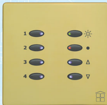
SCE-02-PBR-44 with SCE-02-02-BLK