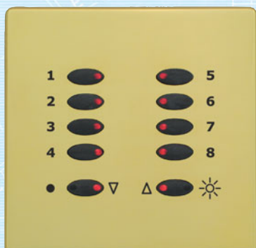
TP-SGP-55-BLK with TP-S-PBR-55