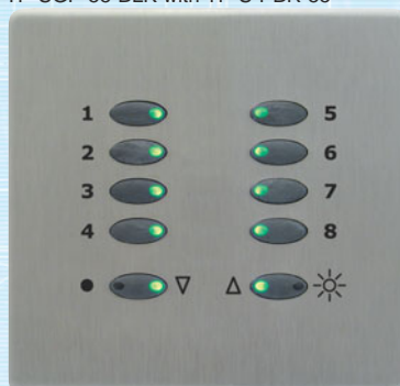
TP-SGP-55-BLK with TP-S-BSS-55