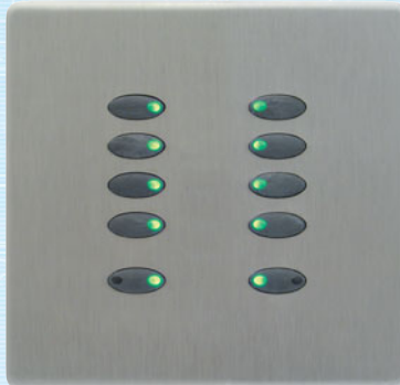
EVO-SGP-55-BLK with EVO-S-BSS-55