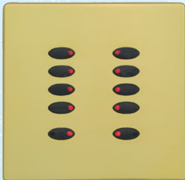
EVO-SGP-55-BLK with EVO-S-PBR-55