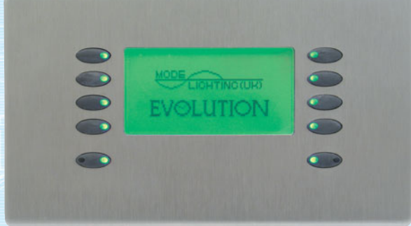
EVO-LCD-55-BLK with EVO-L-BSS-55