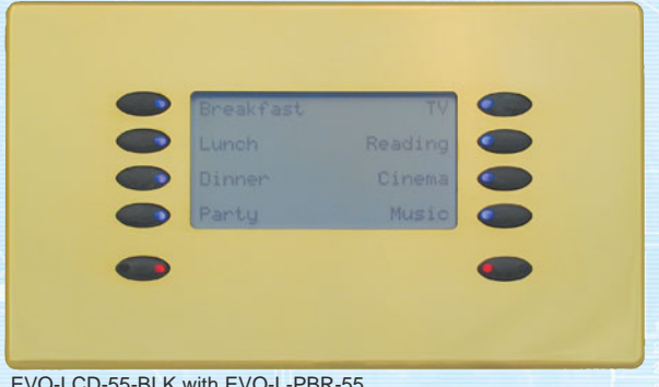
EVO-LCD-55-BLK with EVO-L-PBR-55